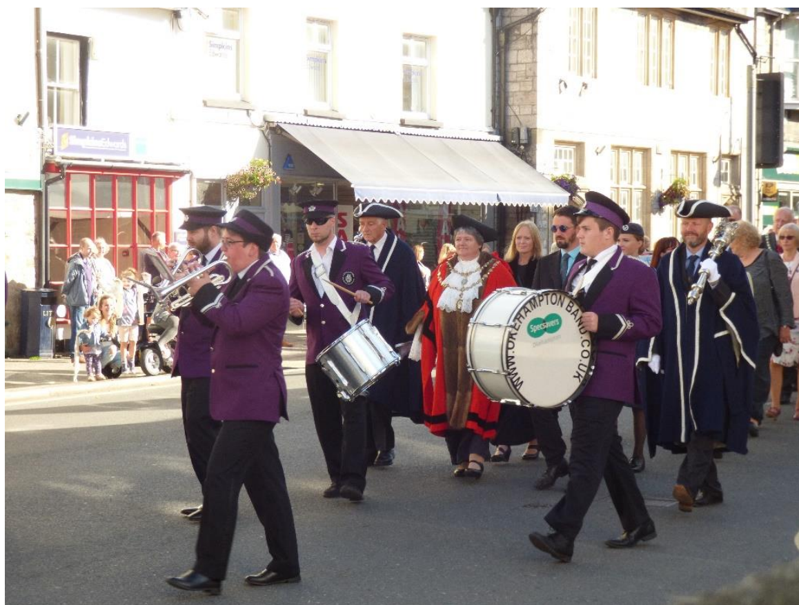
Civic Service – September 2019