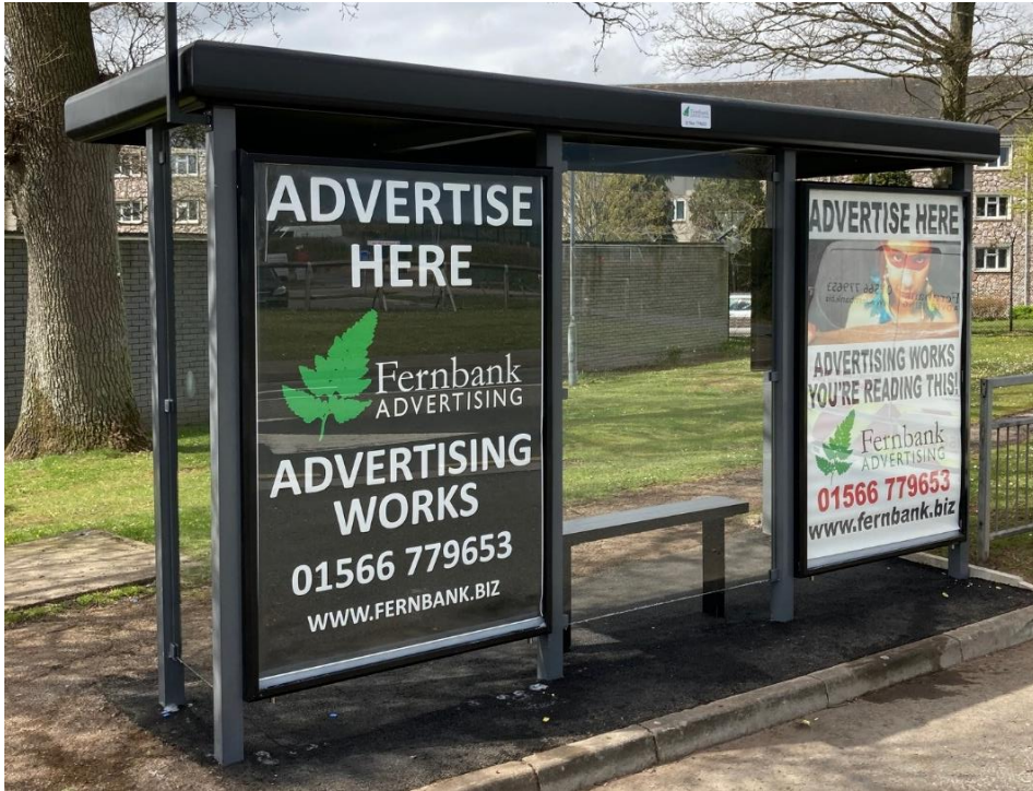
An example of their advertising boards and shelters.

This would cost Okehampton nothing going forward & we would clean & maintain again, at no cost to Okehampton.