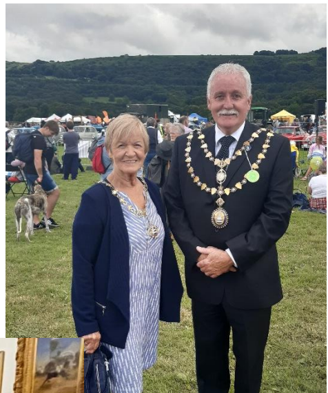
Okehampton Show August 2021