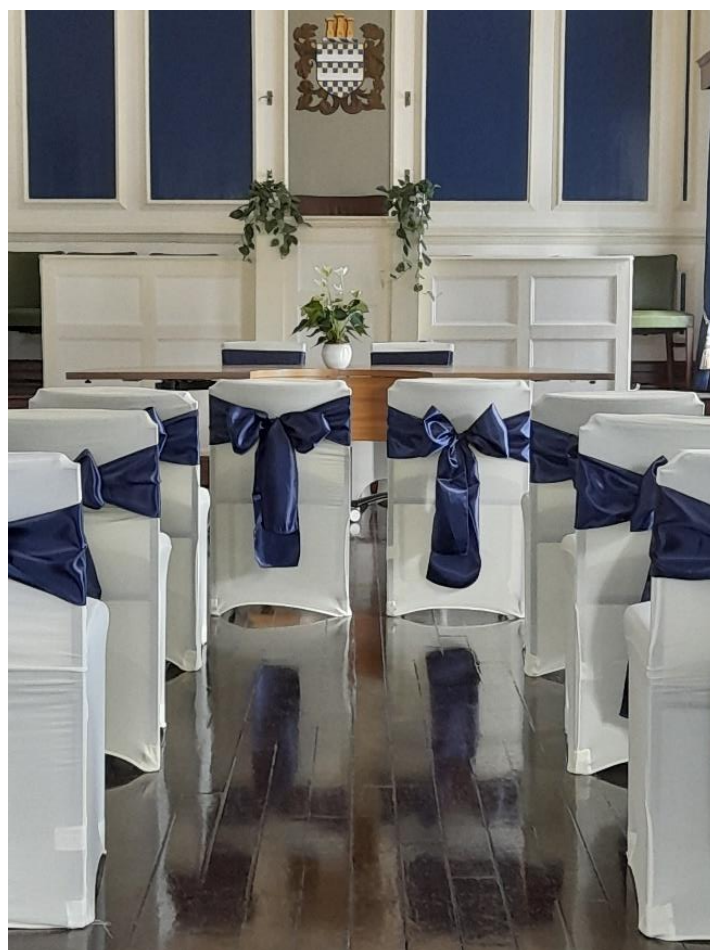
Council Chamber Civic Ceremony Setup