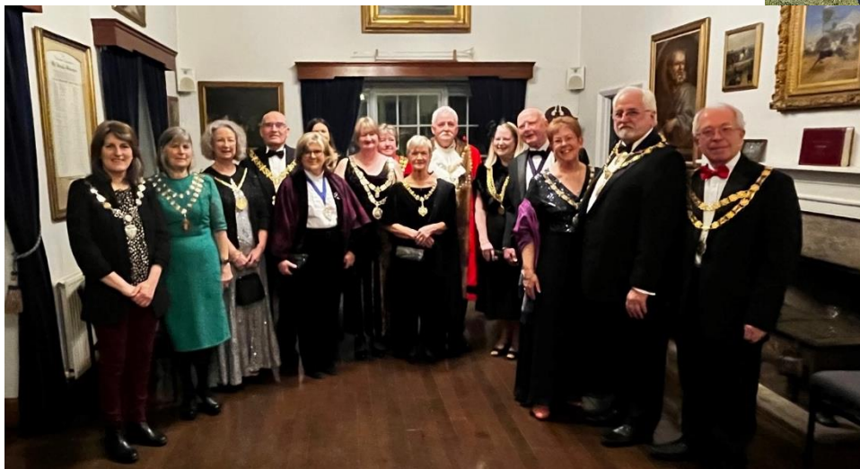
Mayor's Civic Dinner March 2022