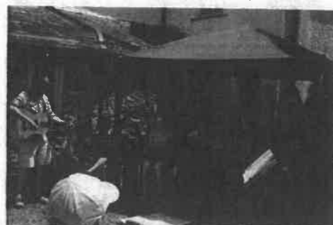
Devon Youth Folk Ensemble