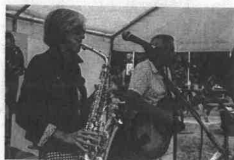
Panic Pete & The Roughbeats