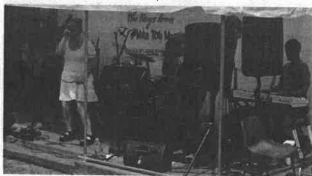
The Strange & The Beautiful