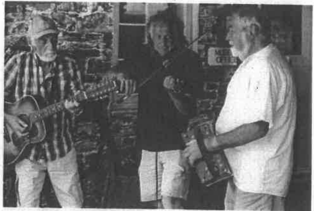
Walter Shortage & The Hosepipe Band

*Last minute additions due to Luna Grey and Rock Steady having to drop out this year.